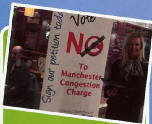
Leading a successful Campaign against congestion charging

"Frequently the system is so slow it causes delays in accessing patients information. It seems that software and management systems that cost millions of pounds are more of a priority to the Government than providing front line medical services."