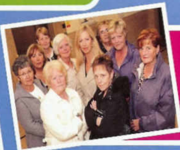
Campaigning with ex-council workers for equal pay