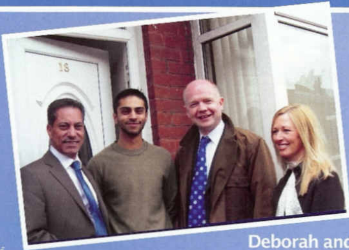
Deborah and William Hague Canvassing

David opens 'Gloves' Amir Khan's Gym in Bolton