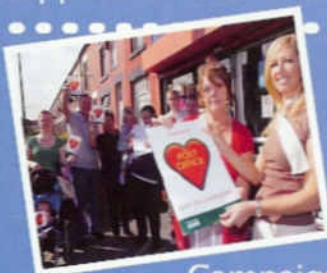
Campaigning to save our Post Offices